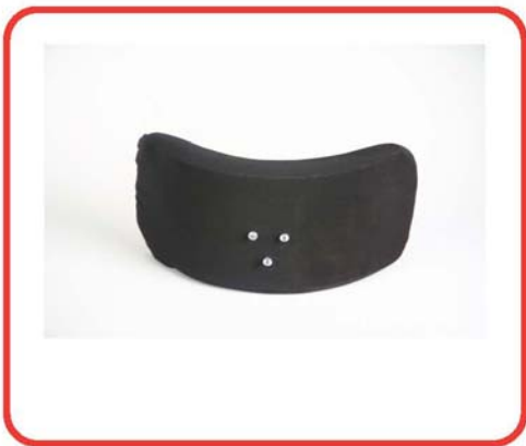
PADDED CURVED HEAD REST