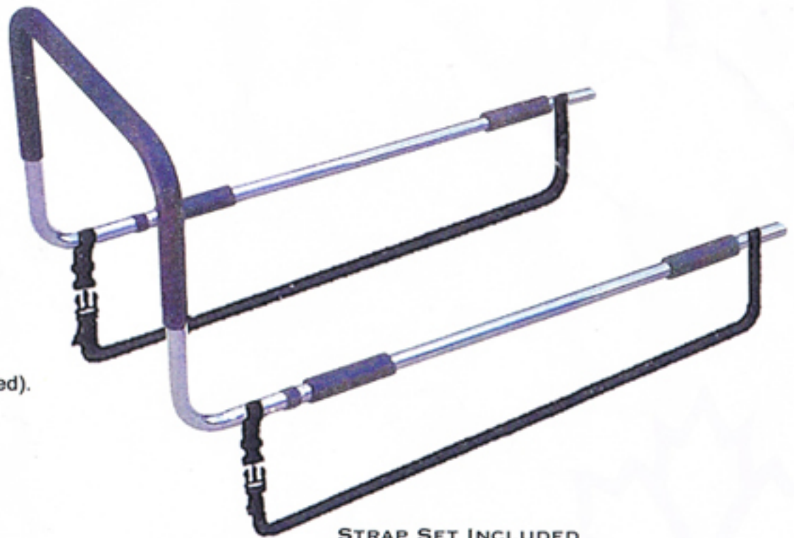
STRAP SET INCLUDED

Not recommended for user having restlessness , erratic body movement, confusion, dementia, and altered mental status.