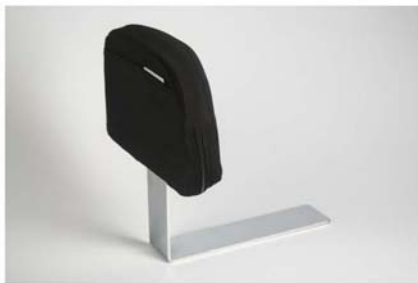
PADDED SHOULDER WING (LATERAL SUPPORT)