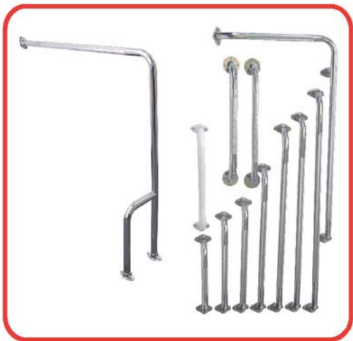
GRAB BARS WITH ROTATING FLANGE